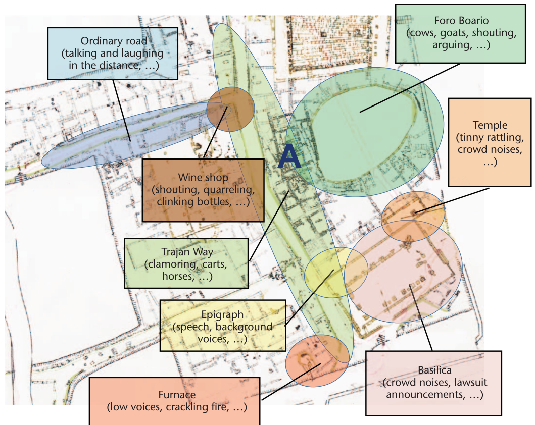
Figure 4. Sound source locations in the Egnathia archaeological park. Here, sound sources often overlap (as they do in real life).

Our aim for the second field study was to evaluate how the introduction of contextual sounds would affect students' experience and learning. We compared the current version of the Gaius' day game, which includes contex-