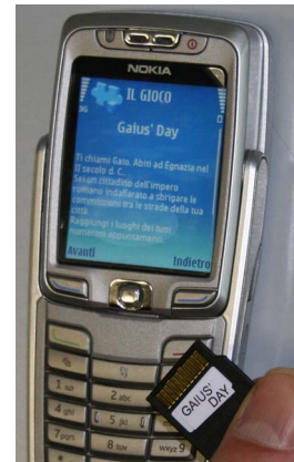
Figure 1. Gaius' Day start screen.

oracle support both game-play and students' learning of the underlying educational content.