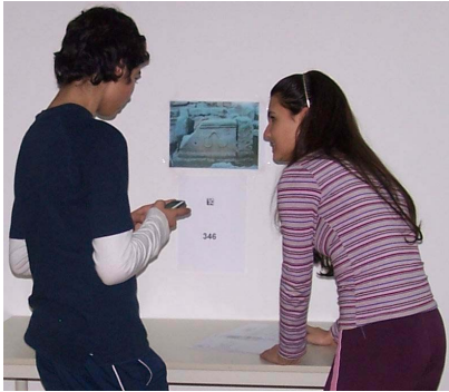
Figure 3. The participants in the pilot study during the execution of the electronic game.

attached to the walls, the students were able to recall the site they had visited, thus simulating their presence in the real site.